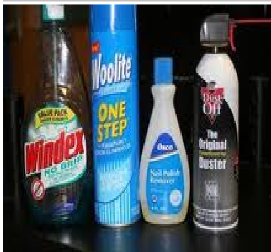
PROPELLANTS CAN BE HUFFED

There have been many cases of young people that have died from huffing "Dust off". "Dust off" contains Difluoroethane, a fluorinated hydrocarbon, also known as Freon. They are used as propellants, refrigerants and cleaning agents. They are heavier than air and when inhaled they keep air out of the lungs which in turn stops brain and heart functions. In many cases the user was found with the straw from the can of Dust off still in their mouth, eyes open and sitting in an upright position. In these cases death was instant, and in most cases the users were very healthy young people between the ages of 12 and 17., according to the Monitoring the Future Study.